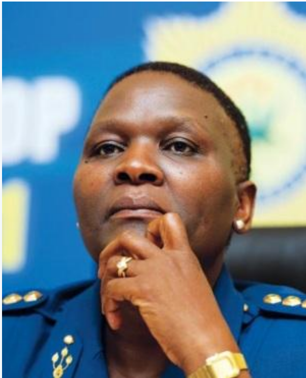
Riah Phiyega

Johannesburg - National police commissioner Riah Phiyega is deeply concerned about allegations that police brutality led to the death of a minibus taxi driver on the East Rand, her office said on Thursday.